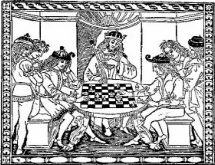
Royal Game of Chess, Frontispiece of Cessolis, Libro di Guico di Sacchi 1493-94