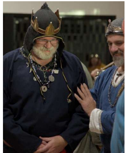
Wulfgar Bradax put on vigil for knighting