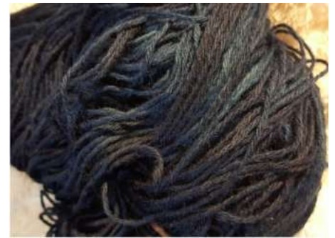
Indigo on wool

Both are beautiful and it honestly just depends on what you are looking for. Japanese indigo, however, will always hold a special place in my heart, and I strongly encourage other interested dyers to experiment with it and see how it compares to woad.