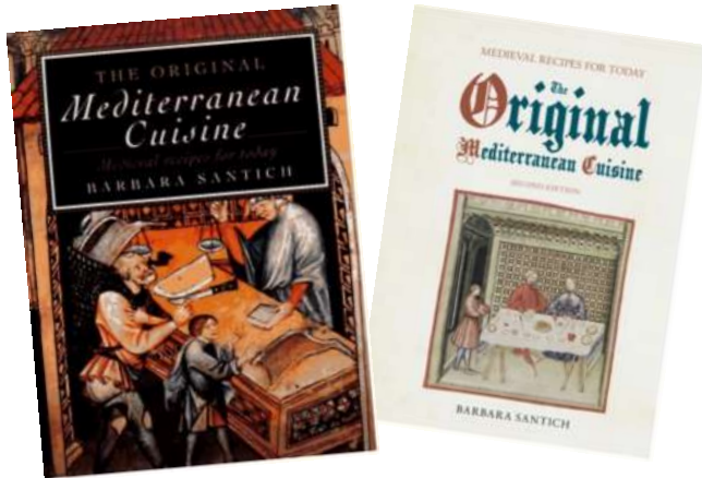
Book covers off public sites. The left image is of the original 1995 edition. The second image is from the 2018 edition.