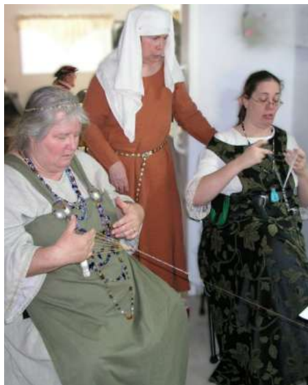
Mistress Alicia teaches finger loop braiding.

Some events are TUTR-only, consisting entirely of classes, but more often classes are included in the program at other events. TUTR classes can be added for most types of events, especially wars,