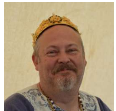
release on file