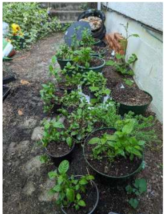
Japanese indigo harvest in the Barony of Seagirt, 2023