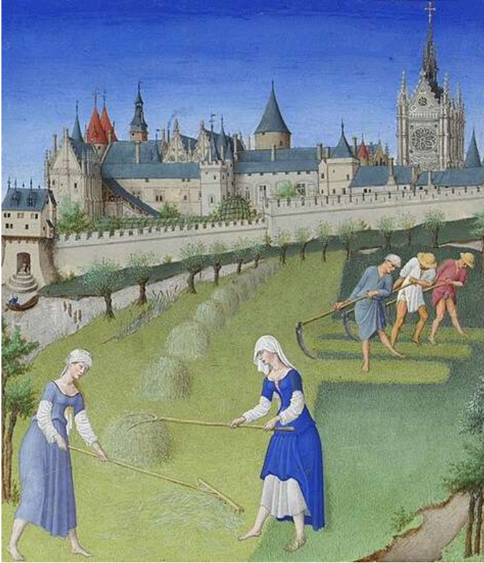
June, the month for haying, from the Très Riches Heures du Duc de Berry . In the background is the Palais de la Cité with the Sainte Chapelle clearly identifiable on the right. The Très Riches Heures is an illuminated manuscript that was created between c. 1412 and 1416.

In the Middle Ages, time was braided into the rhythms of the Church and the changing seasons, creating a calendar that shaped every aspect of daily life. Feast days, fasts, and saints' celebrations offered a sacred structure that guided work, rest, and community gatherings, while the turning of the agricultural year, from planting to harvest, dictated survival. For medieval people, the passage of time was not measured by clocks or schedules, but by the ringing of church bells, the lengthening and shortening of days, and the cycle of holy observances that gave the year its pulse. These monthly calendars are included here in the hope of helping you, the reader, become grounded in the Middle Ages through the very rhythms and observances that shaped the lives of so many people at that time. The following excerpt has been used with permission from the author.